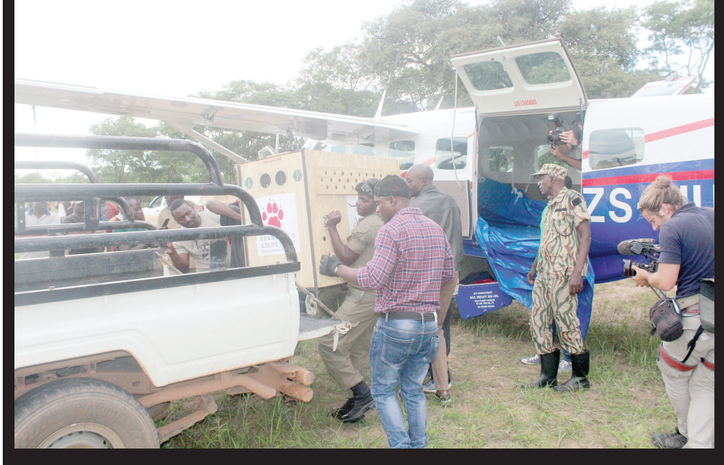
AFRICAN Parks and Department of National Parks and Wildlife officers load a box carrying a cheetah on a Toyota Land Cruiser. Three cheetahs from South Africa were reintroduced into the Bangweulu Flats in Lavushimanda district in Muchinga Province recently.

When the moment is right, a cheetah will sprint after its quarry and attempt to knock it down. Such chases cost the hunter a tremendous amount of energy and are usually over in less than a minute. If successful, the cheetah will often drag its kill to a shady hiding place to protect it from opportunistic animals that sometimes steal a kill before the cheetah can eat. Cheetahs