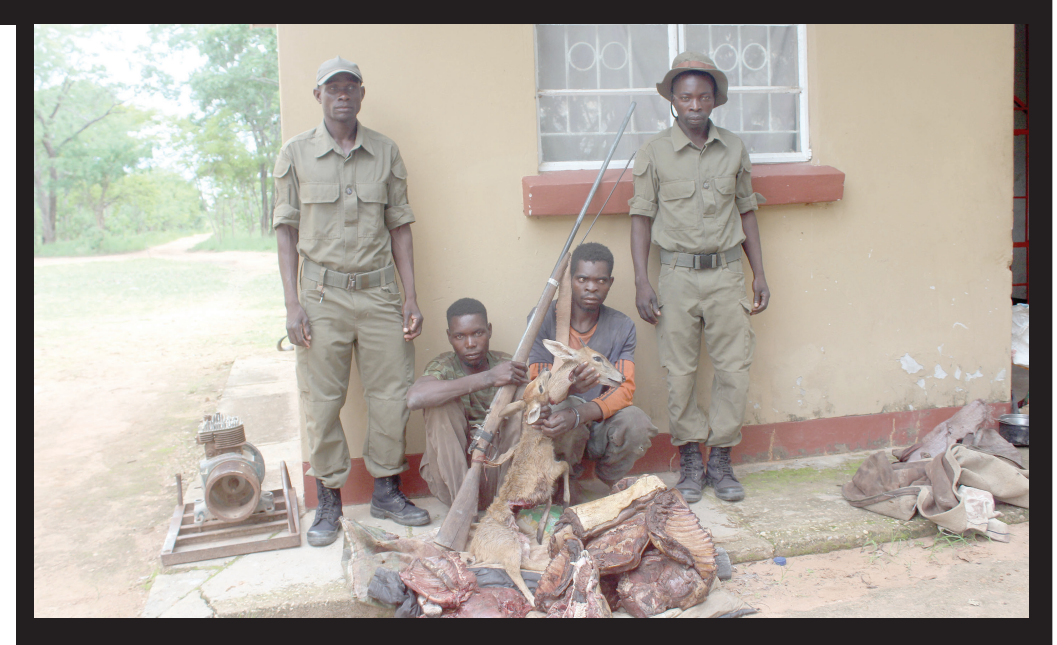
AFRICAN Parks Lavushimanda National Park scouts with two poachers (squatting) caught with 17kg of duiker and 38kg of bush pig meat in Muchinga Province recently.

achievement that Zambia shares," Mr Simukonda said. He said the coming back of the cheetahs is not by mistake as Government started preparing for this venture by developing the cheetah management plan in 2017, which made African Parks to approach Government with